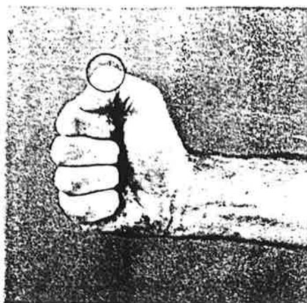
OYA YUBI KEN