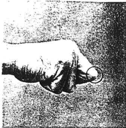
NAKA YUBI IPPON KEN